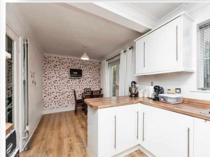
The Bauhaus New Lane, East Ardsley Wakefield WF3 2DP