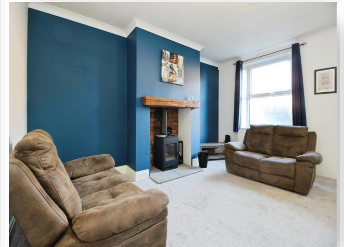
Grange Buildings, Morley Leeds LS27 0HX