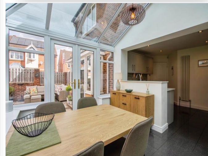
Trafalgar Gardens, Morley Leeds LS27 0RU