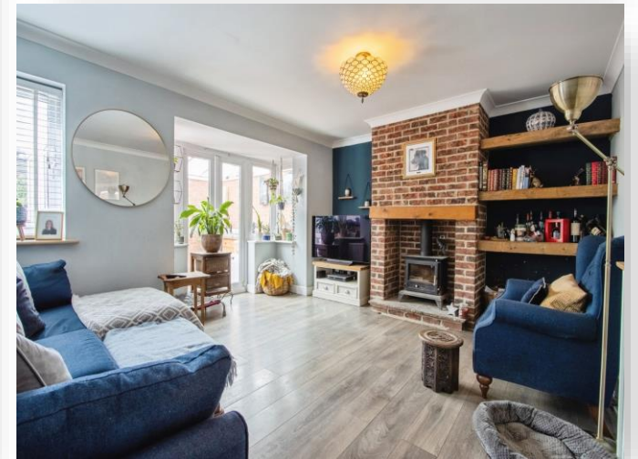
Martingale Drive, Leeds LS10 4TB