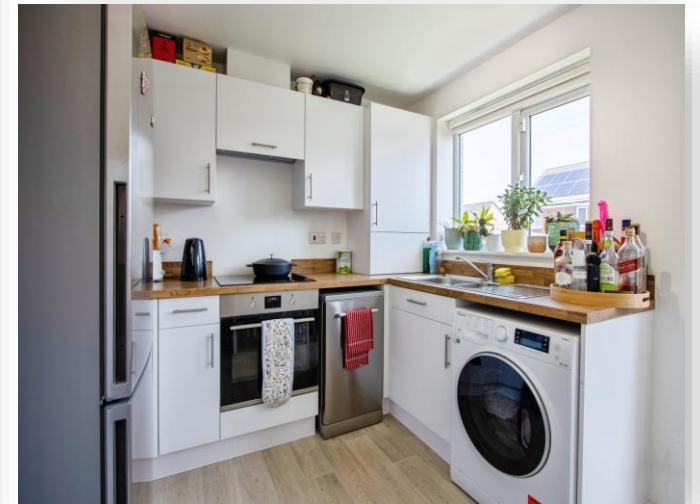
Rotary Drive,Morley LEEDS LS27 8FR