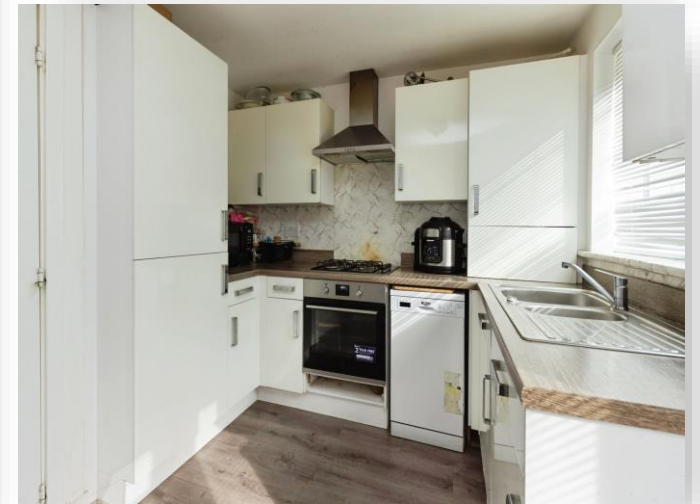
Siegen Way, Morley Leeds LS27 8FL