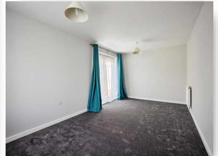
Daisy Hill, Morley Leeds LS27 8EH