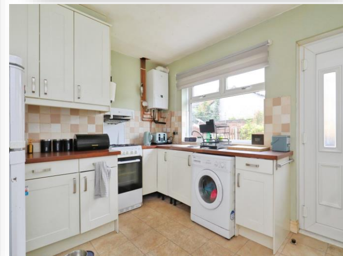
Westbury Place North, Leeds LS10 3DE