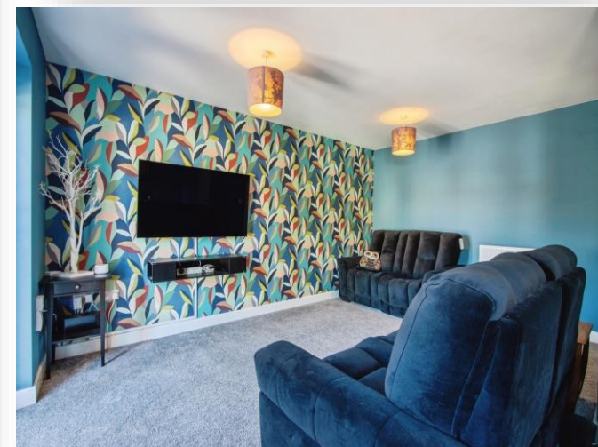
Weavers Close, Morley Leeds LS27 9FF