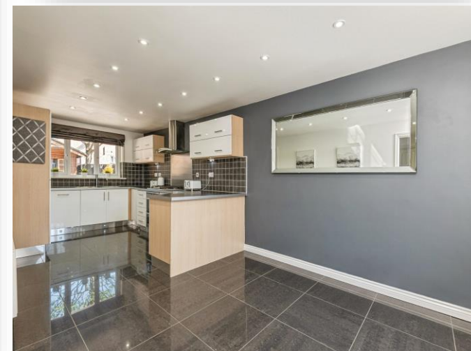
Murray Way, Leeds LS10 4GA