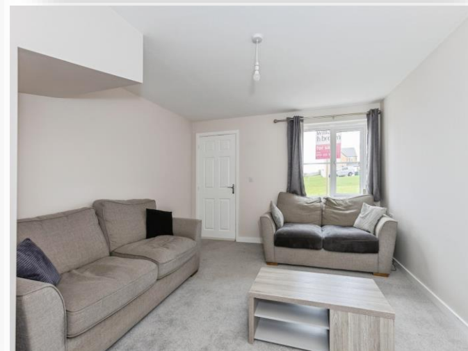
Siegen Way, Morley Leeds LS27 8FL