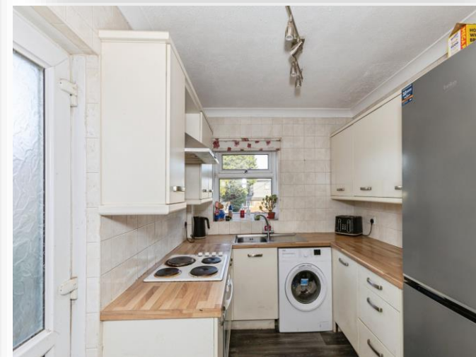
Springbank Road, Gildersome Leeds LS27 7DJ