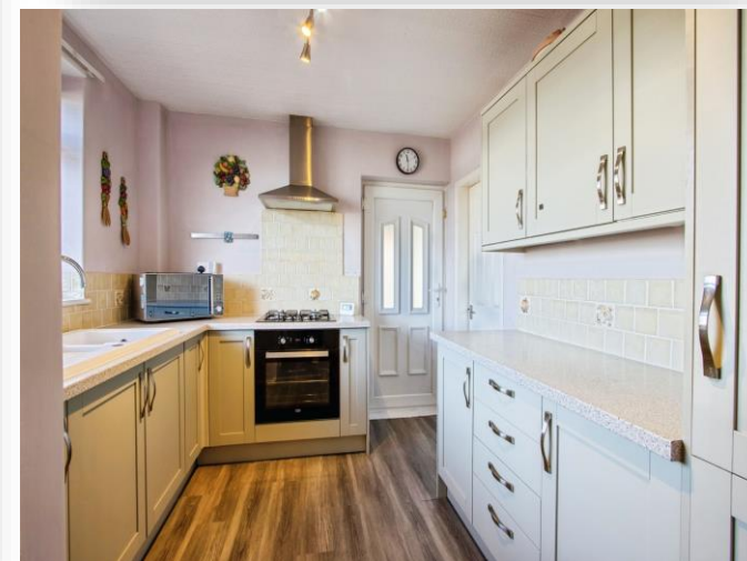
Leigh View, Tingley Wakefield WF3 1NJ