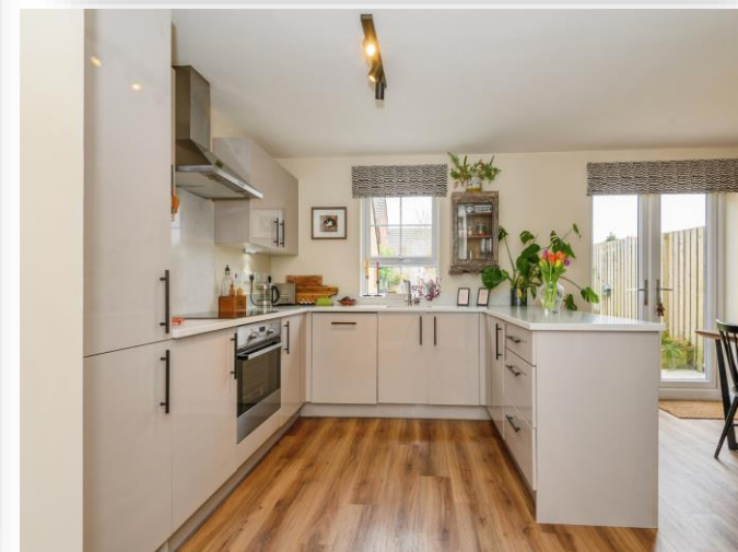
Carson Grove, Morley Leeds LS27 0GE