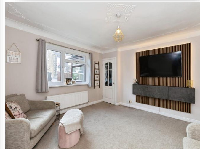
Springfield Lane, Morley Leeds LS27 9PL