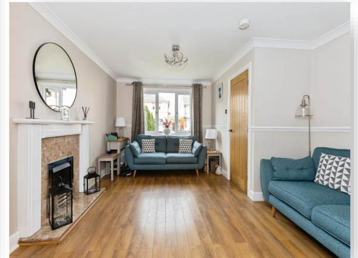
Pipit Meadow, Morley Leeds LS27 8GX