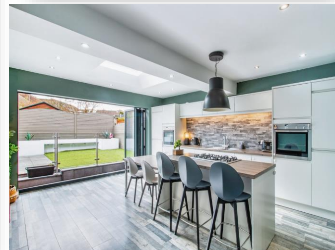
Casson Avenue, East Ardsley Wakefield WF3 2EG