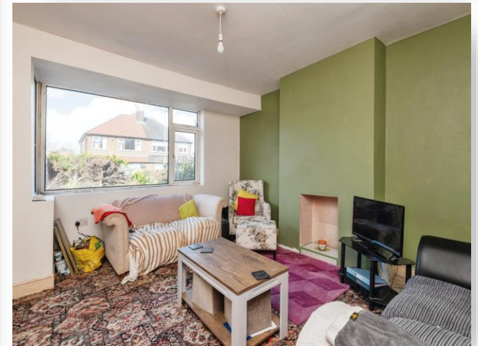
Scatcherd Lane, Morley Leeds LS27 9BE