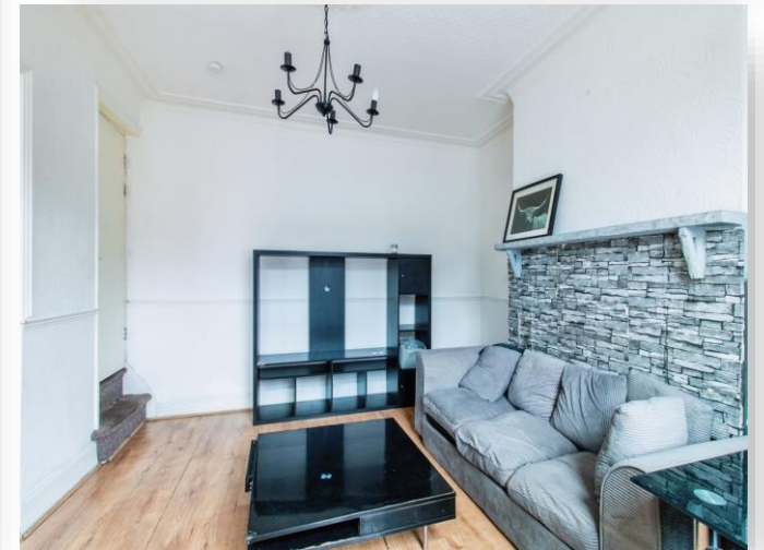
Rydall Street, Leeds LS11 9LF