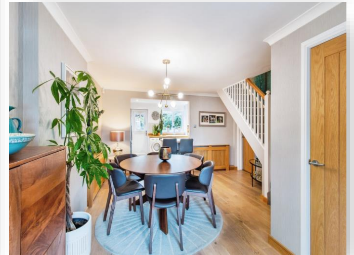
Blackgates Court, Tingley Wakefield WF3 1TH