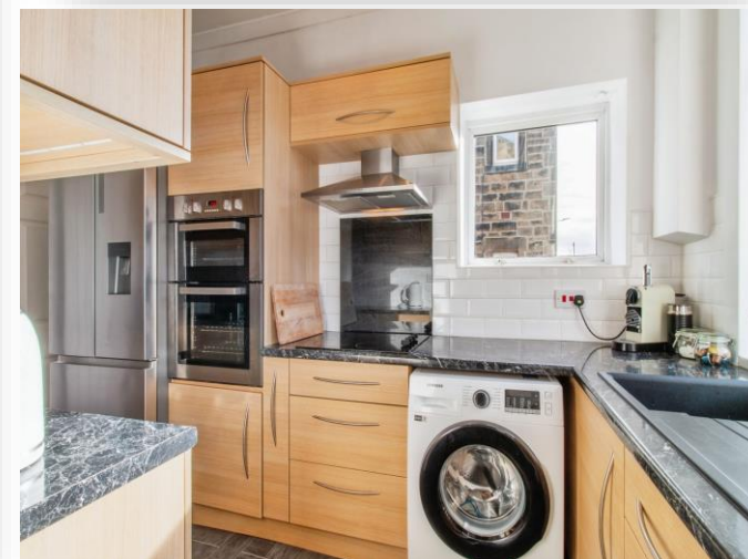
Springfield Road, Morley Leeds LS27 9PN