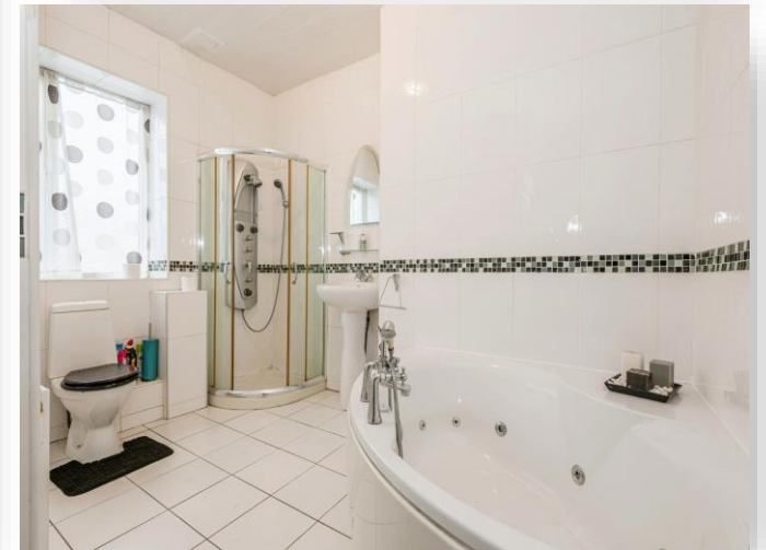
Gillroyd Parade, Morley Leeds LS27 8AN