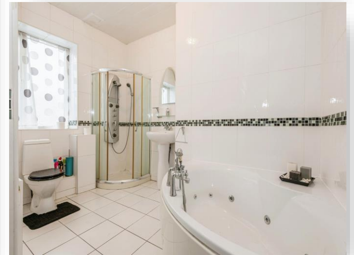
Gillroyd Parade, Morley Leeds LS27 8AN