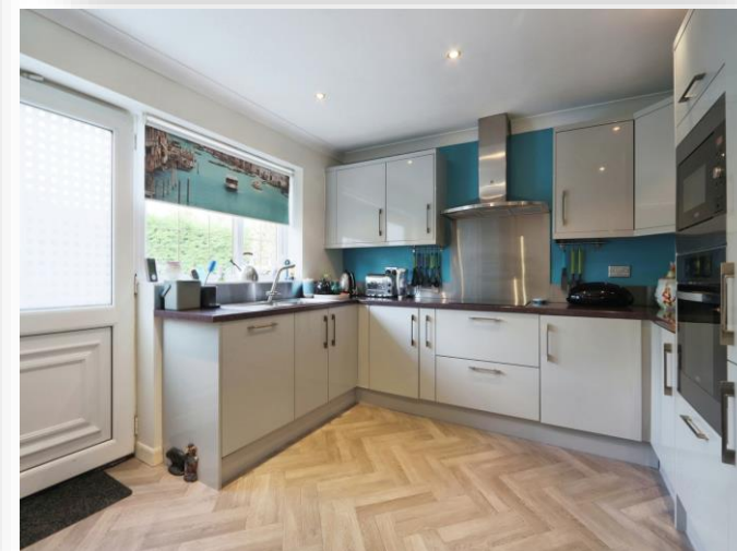
Fall Lane, East Ardsley Wakefield WF3 2BG