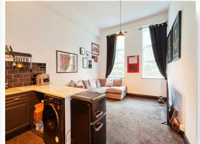
Victoria Court Victoria Mews, Morley Leeds LS27 9DA