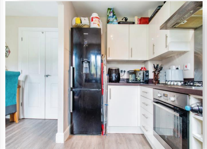
Scampston Drive, East Ardsley Wakefield WF3 2FN