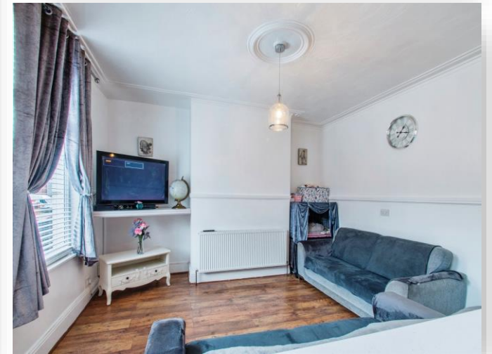
Rydall Terrace, Leeds LS11 9LD