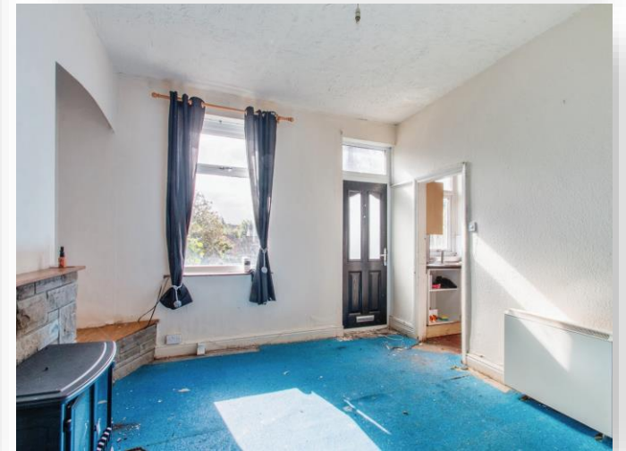
Rods View, Morley Leeds LS27 8AH