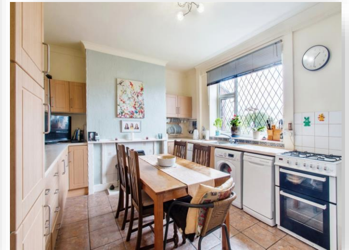
Mill Lane, East Ardsley Wakefield WF3 2BL