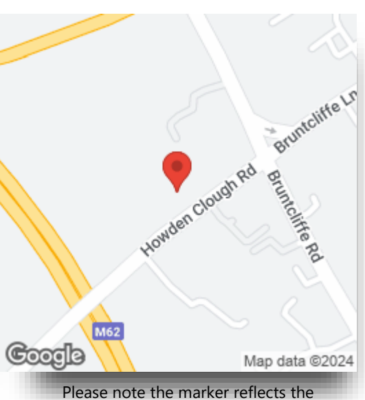
postcode not the actual property