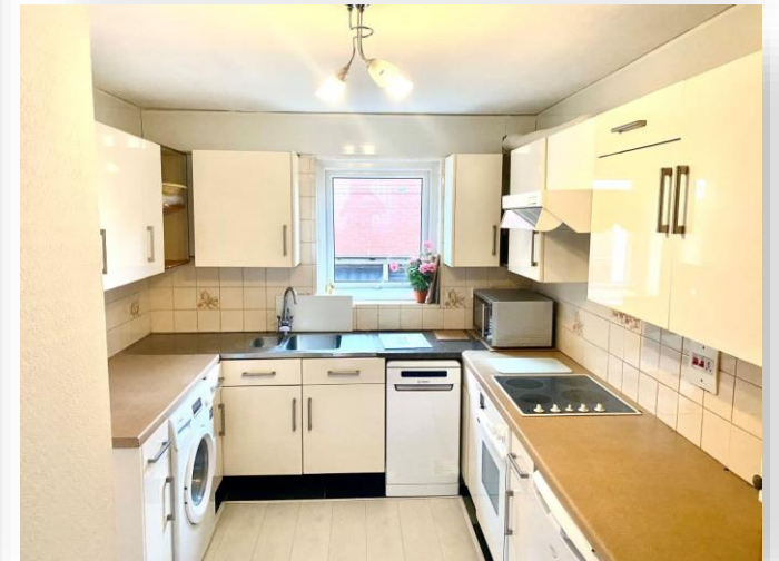
Flaxton Street, Leeds LS11 6DH