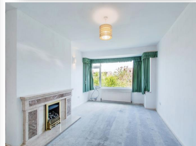
Casson Drive, East Ardsley Wakefield WF3 2EJ