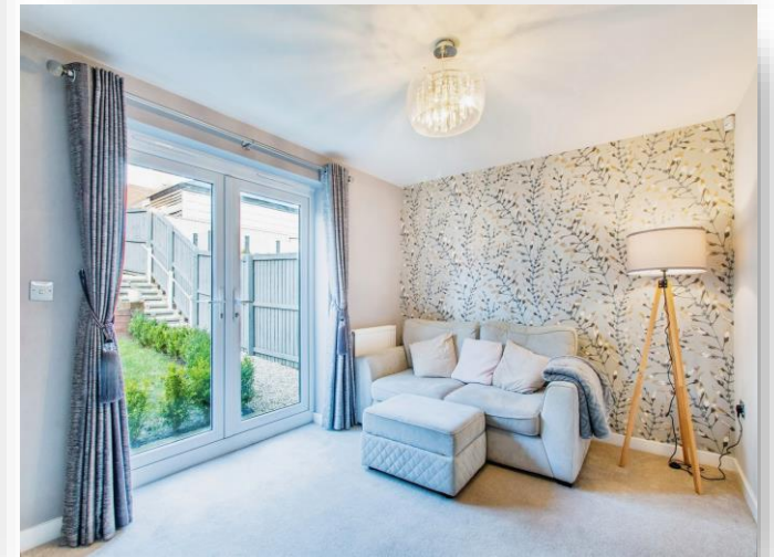
Throstle Road,Leeds LS10 4HF