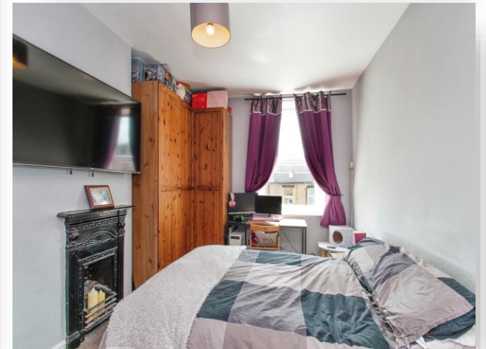
Hartley Place, Morley Leeds LS27 8AL