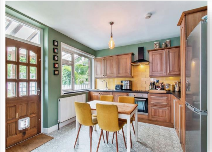
Sunnyview Avenue, Leeds LS11 8QY