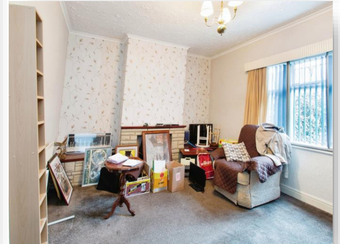
Dewsbury Road, Tingley Wakefield WF3 1LX