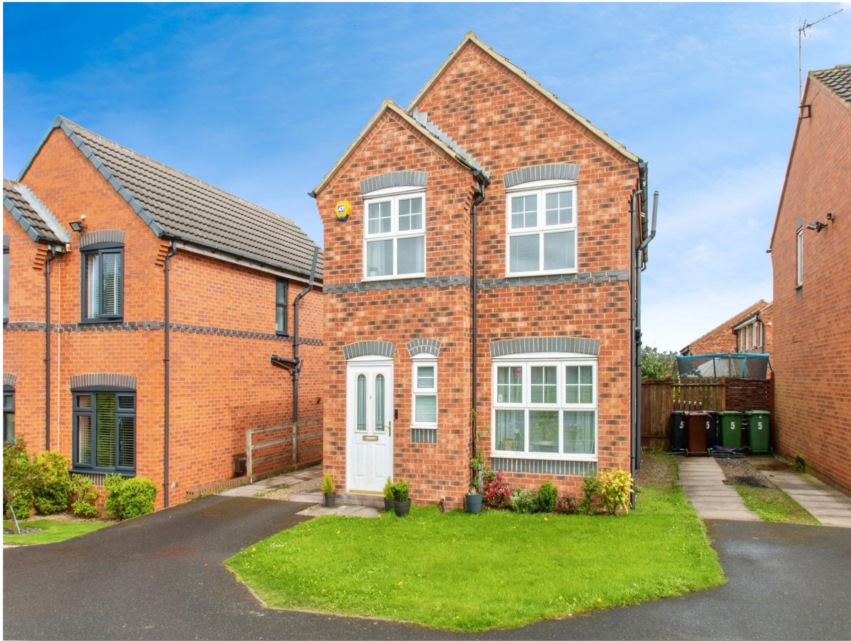
Badminton Drive, Leeds LS10 4UN