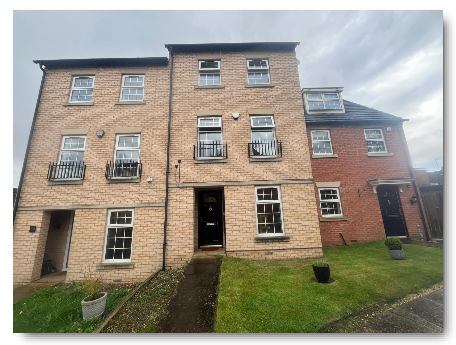
Renaissance Drive, Morley Leeds LS27 7GB