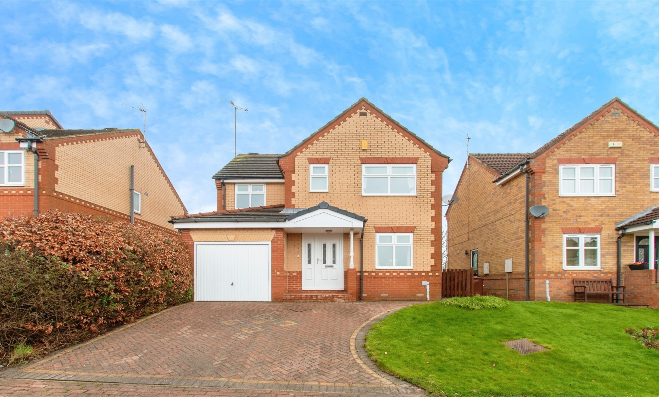
Kingfisher Mews, Morley Leeds LS27 8GT