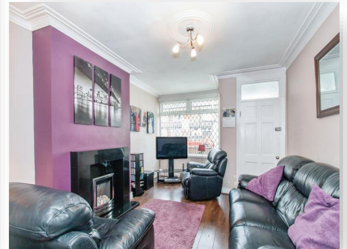
Cross Flatts Street, Leeds LS11 7JJ