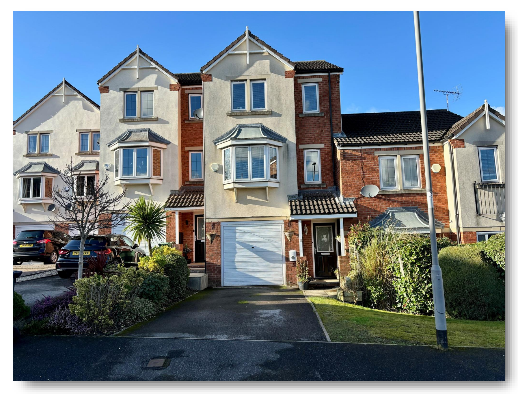
Fielding Way, Morley Leeds LS27 9AB