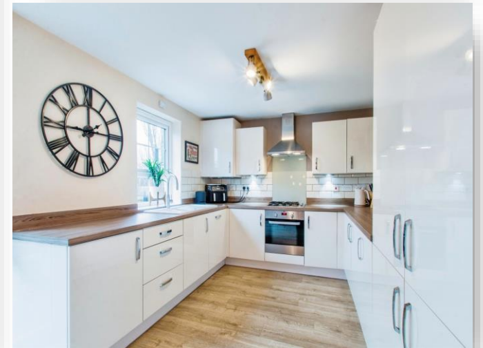
St. Michaels Drive, East Ardsley Wakefield WF3 2GA