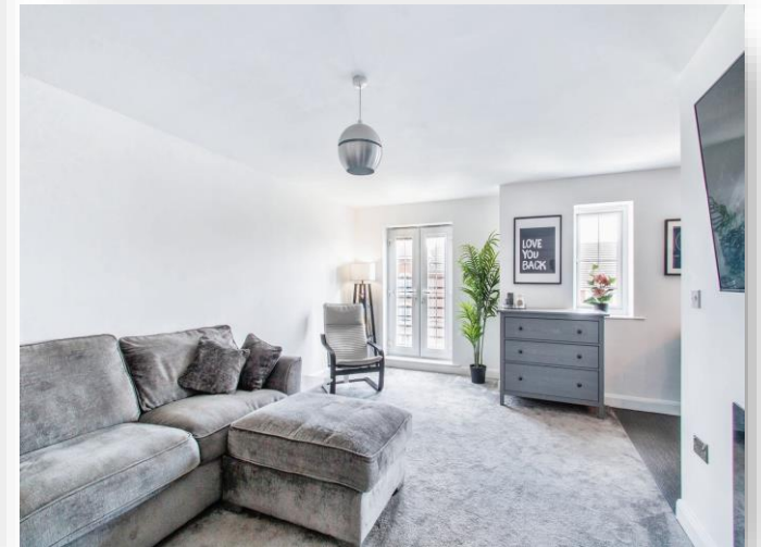
Flat 37 The Willows Fenton Gate, Middleton Leeds LS10 4FT