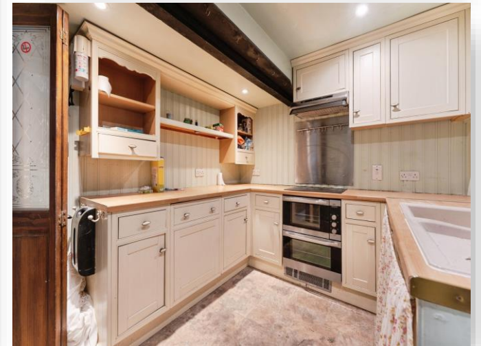
Market Place, Mildenhall IP28 7EF