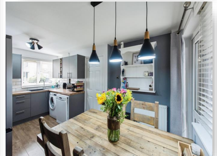
Downing Close, Mildenhall IP28 7PB