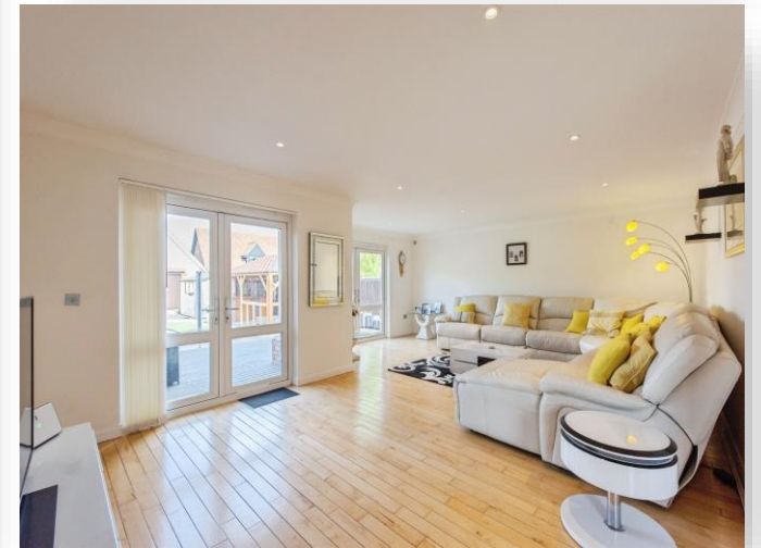
Turnpike Lane, Red Lodge IP28 8LF