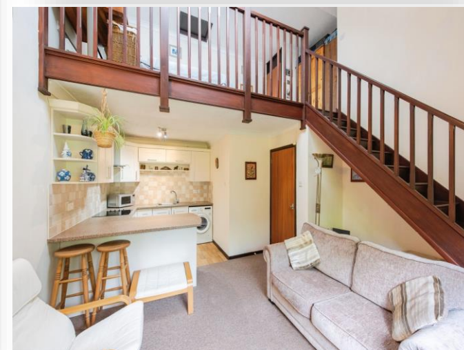
Nightingale Close, Mildenhall IP28 7HQ