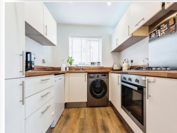
Myrtle Lane, Red Lodge IP28 8RW