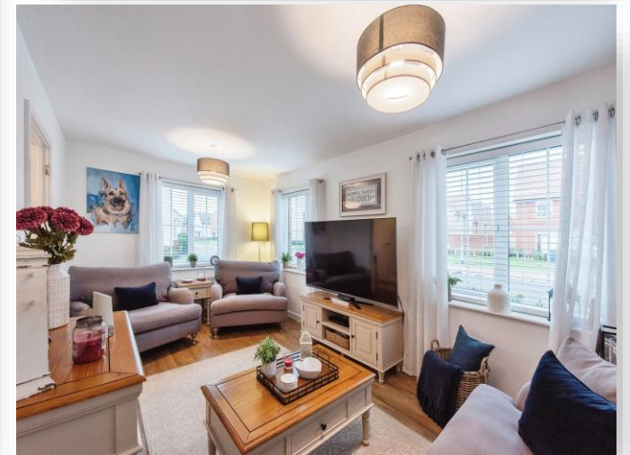
Oaklands Drive, Red Lodge IP28 8ZX