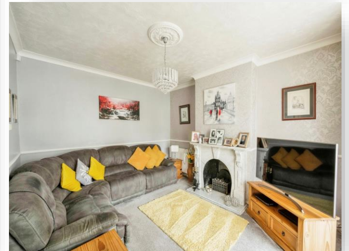
Barnsley Road, Goldthorpe Rotherham S63 9AA